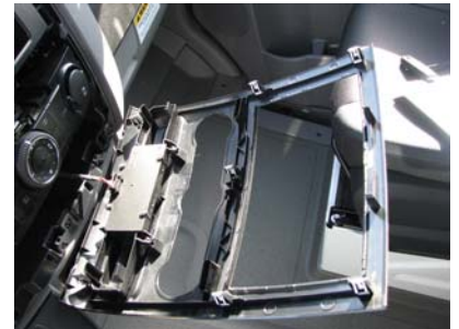
Radio Bezel Removed

INSTALLATION IS NOW COMPLETE. ENJOY YOUR NEW INDASH by PANAVISE MOUNT.