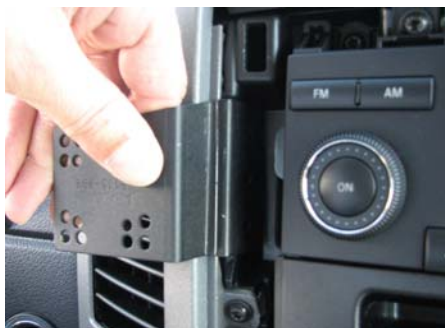
Left Side Mounting Location