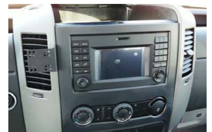
Double Din Radio Mount Installed