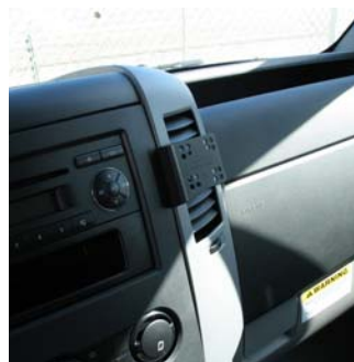
Right Side Mounting Location