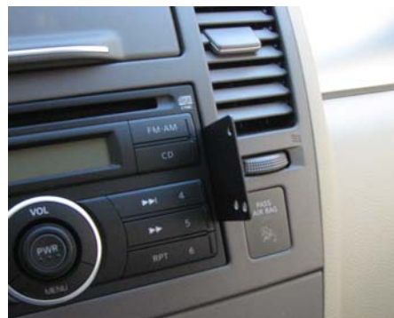
Bottom Part in Place