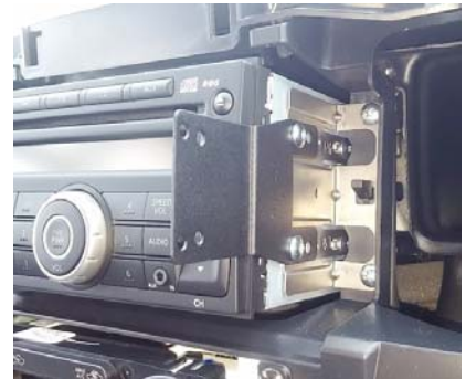
Bottom part of mount in place