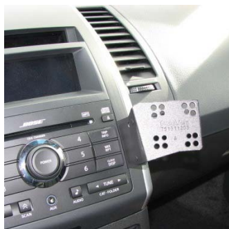
InDash Final Installation