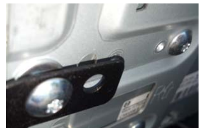
Washer in Place Under Mount