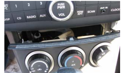
Climate Control Removal (All)

INSTALLATION IS NOW COMPLETE, ENJOY YOUR NEW INDASH BY PANAVISE MOUNT!