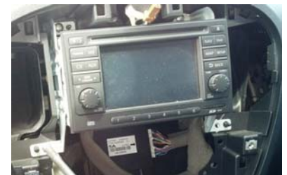
4 Radio Screws Locations