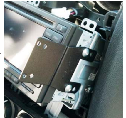
Bottom Piece Installed (over)