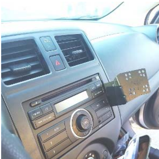
InDash Mount in place showing location