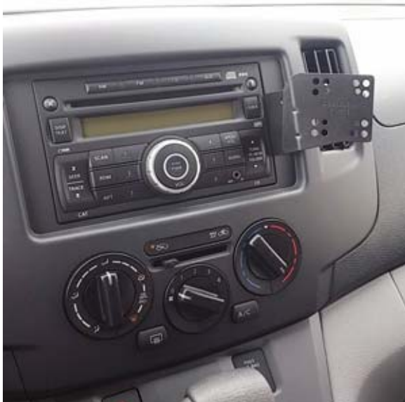
InDash Mount in place showing location