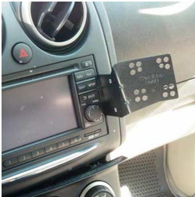
InDash Installed Showing Location 2012-13 Rogue with 5" screen NAV

There may be recent updates to this Instruction Sheet, please visit our website or contact PanaVise Products, Inc. for the latest revision as well as for the most complete up-to-date PanaVise InDash Applications List: 7540 Colbert Dr., Reno, NV, Phone: 800.759.7535, 775.850.2900, Fax: 800.395.8002, www.panavise.com. © 2017 PanaVise Products, Inc.