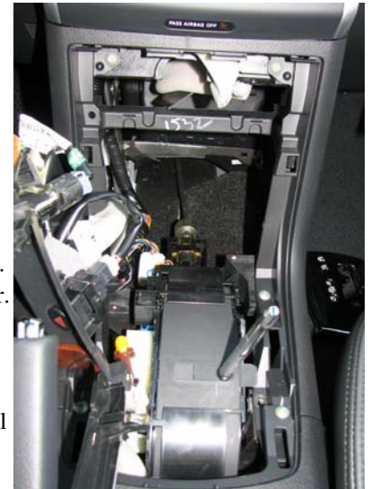
Console Bezel Removed

** ADVISEMENT ** Read instructions completely prior to starting installation. All InDash Mounts are designed so that after installation, phone is facing normal driver position for left-hand drive vehicles. This mount is not designed to be used in foreign countries with right-hand drive vehicles. Use extreme care when working around the plastic components on the dash. Excess force, can cause breakage of the plastic components.