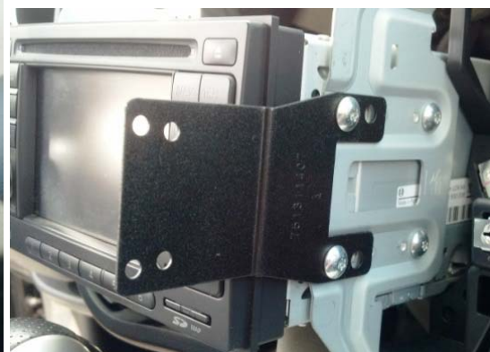
InDash Bottom Installed on Radio- Juke washers hidden