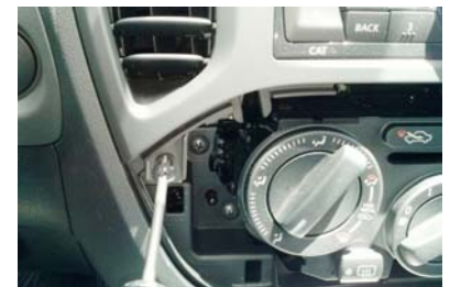
Screws to Remove Vent Bezel