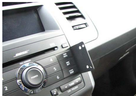
Bottom Piece Installed