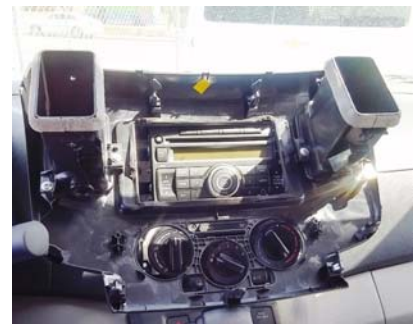
Main bezel removed

INSTALLATION IS NOW COMPLETE. ENJOY YOUR NEW INDASH by PANAVISE MOUNT