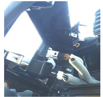
Plugs to disconnect as needed