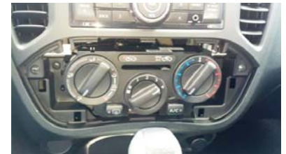
Man.Climate Control Bezel

INSTALLATION IS NOW COMPLETE. ENJOY YOUR NEW INDASH by PANAVISE MOUNT