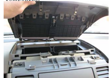
Removal of Top Cover & Screws

INSTALLATION IS NOW COMPLETE. ENJOY YOUR NEW INDASH by PANAVISE MOUNT