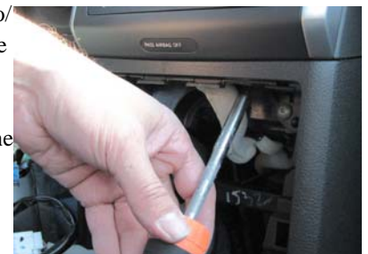
Radio Bezel Screw Removal