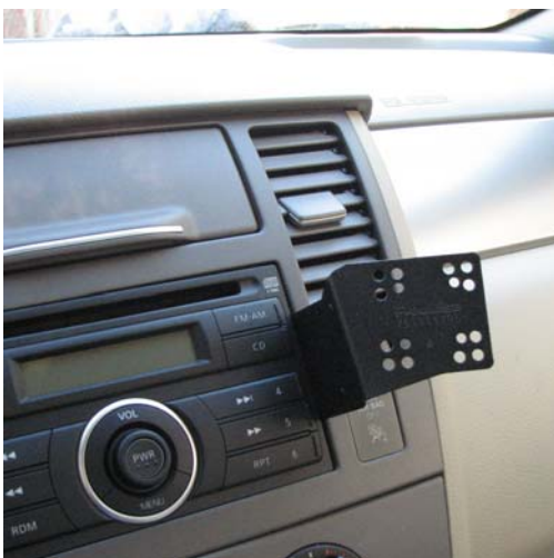
InDash installed showing location