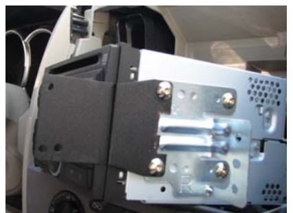
Prototype Mounted on Radio