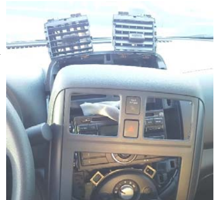
Radio Bezel/Air Vents removal

INSTALLATION IS NOW COMPLETE. ENJOY YOUR NEW INDASH by PANAVISE MOUNT