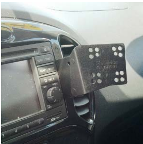
InDash Installed Showing Location-